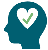
Dementia and Mental Wellbeing Service