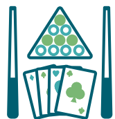
Multi-function games room