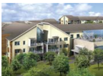
Pannel Croft Village, Birmingham