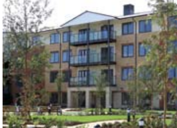
St. Oswald's Village, Gloucester