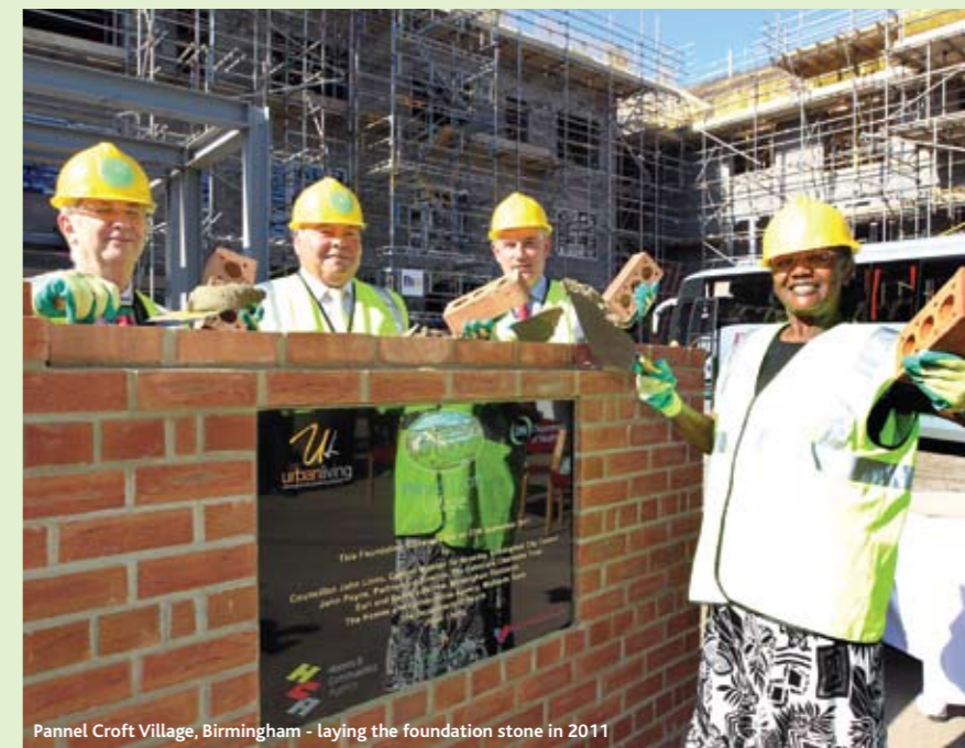
Pannel Croft Village, Birmingham - laying the foundation stone in 2011

In October 2010 we opened St Oswald's Village in Gloucester in partnership with Rooftop