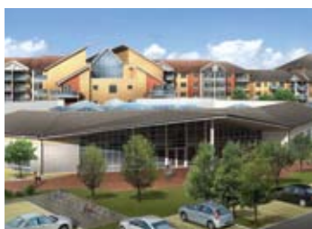
Shenley Wood Village, Milton Keynes