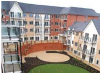
New Oscott Village, Birmingham