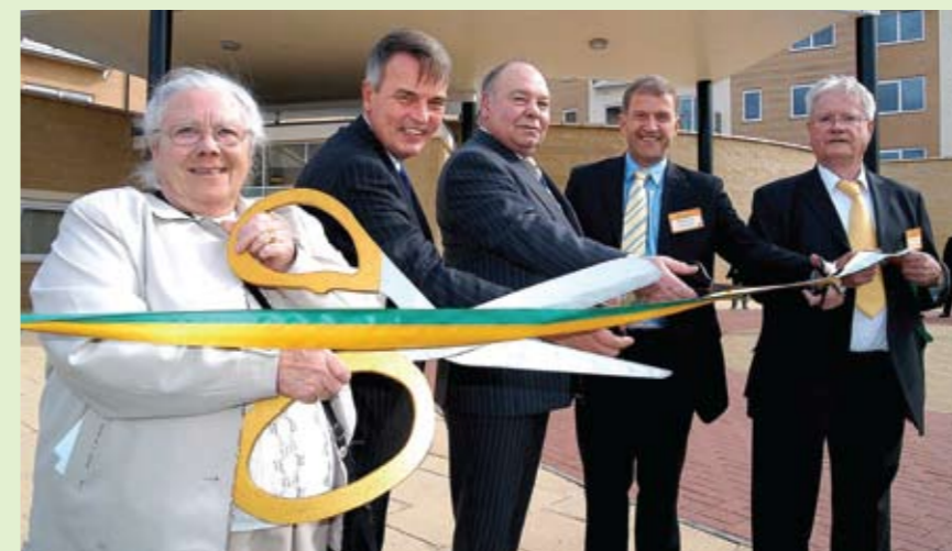
New Oscott Village, Birmingham - opened in 2010

ExtraCare is already an accredited provider of landlord services with the Tenant Services Authority and during 2012 we will apply for 'Registered Provider' status, which will enable us to own and manage social rented housing in our own right and to receive grants directly from the Homes and Communities Agency. This status will provide us with greater flexibility and responsiveness in addressing local needs.