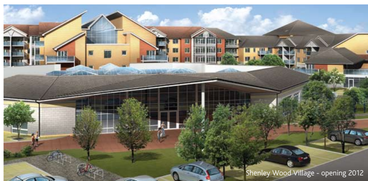
Shenley Wood Village - opening 2012