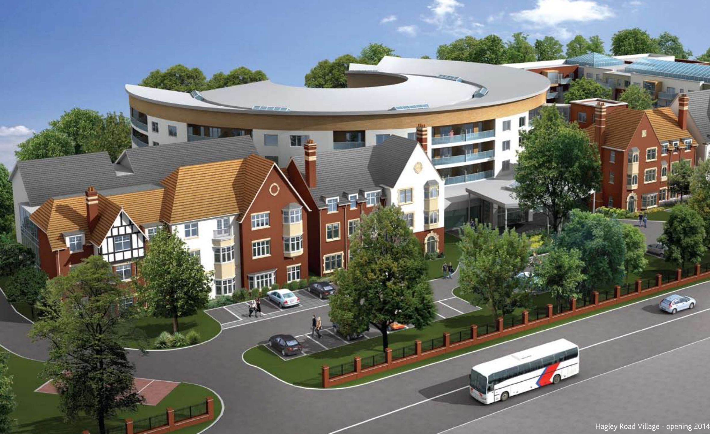
Hagley Road Village - opening 2014