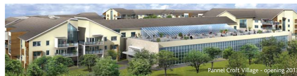
Pannel Croft Village - opening 2013